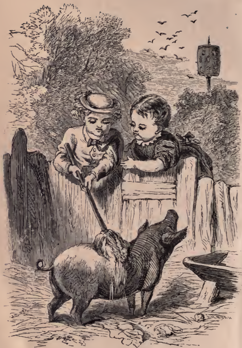
WASHING THE PIG. — Page 137.